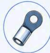
CABLE LUGS & FERRULES