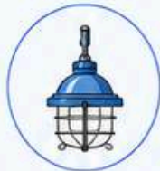
EXPLOSION- PROOF LIGHTING