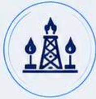
Oil & Gas Industry