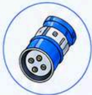
INDUSTRIAL PLUGS & SOCKETS