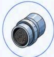
CONNECTORS & ACCESSORIES